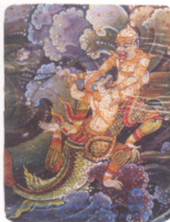
Ramayana, an Indian epic, absorbed into cultures of Southeast Asia and retold through traditional art & craft