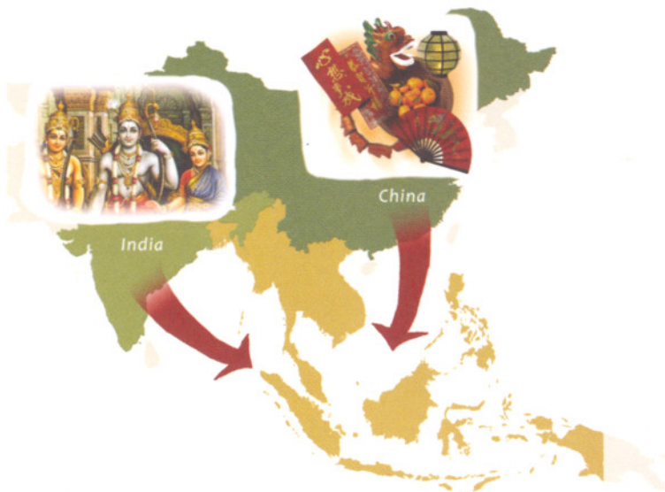
Cultural influences from India and China

What are the challenges of an uneven development of members? How could ASEAN deal with them?