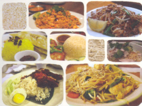
Rice and noodle as common dishes